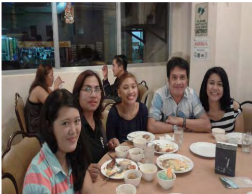
Group Home Christmas Party